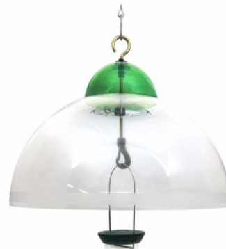
Droll Yankees Mod. SQBK

A dome can be an effective solution to protect seeds that are offered in hanging feeders. However, the dome's diameter has to be at least 14". There are several squirrel-proof models. Some of them are conical and some are round. Some domes come with hooks or adjustable chains