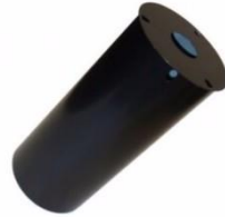
Baffle Erva Mod. SB1N

that allow for installing the feeders easily. Other models have an opening that allows you to slide the feeder's hanger through in such a way that the dome sits right on top of the feeder. For a dome to be effective, one must ensure that the seeds cannot be accessed from the sides or the bottom of the feeder. For instance, if the feeder is hanging from a tree with lower branches, the dome won't prevent squirrels from jumping onto the feeder. Squirrels can also climb a pole to access a feeder from the bottom.