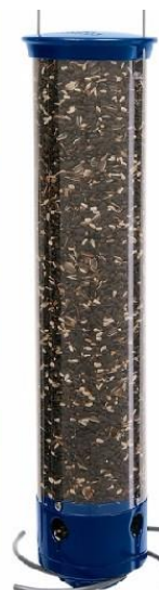
D. Yankees "Whipper"

All the Squirrel Buster feeders operate on the same principle, which consists of a part on the feeder that moves downwards with the squirrel's weight and closes access to the food. Squirrels usually give up when they understand that they can't eat there. This mechanism is effective even against red squirrels, which tend to weigh less than the grey squirrels. Since most of the birds that come to the feeders weigh less than squirrels, birds can eat peacefully without having to worry