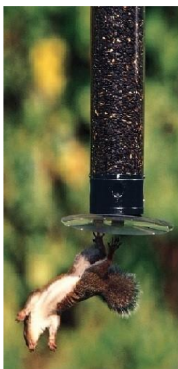
Droll Yankees "Tipper"