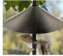
Baffle Erva Mod. SB8