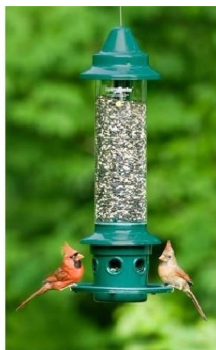
Squirrel Buster +