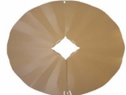
Baffle Erva Mod. SB7 4X4

Squirrel baffles are accessories that come in cylindrical, conical or disc-like shapes and attach around a pole to prevent squirrels from climbing up to feeders that are suspended or that sit at the end of the pole. In order to be effective, squirrel baffles have to be installed at least 4 or 5 feet from the ground and 3 feet from trees or any objects that could serve as a platform for the squirrel to jump onto the baffle and then go up the pole to the feeder. Squirrel baffles are usually installed around a pole whose diameter is from \frac{1}{2} " to 1\frac{5}{8} ". There are also round baffles that can be installed around 4x4" square wooden poles. Another option is a polycarbonate baffle that fits 1" poles and comes with a seed tray to catch the seeds that fall from the feeders. This reduces food for squirrels to eat on the ground beneath the feeders. Let's keep in mind that in many cases, the seeds that fall onto the ground are the ones that first attract the squirrels to the feeders.